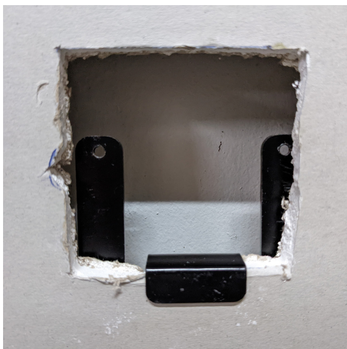
Ensure screw holes are visible