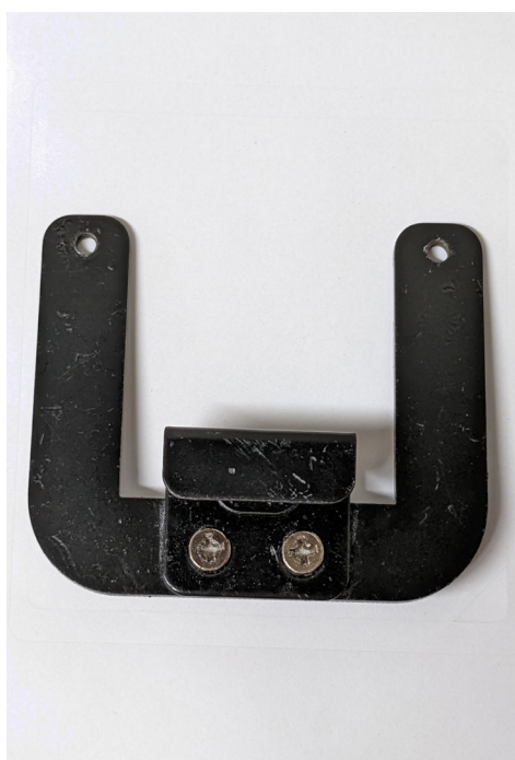
Black Plasterboard clip