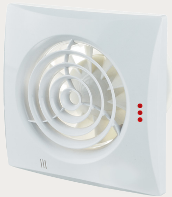
Quiet 150: EMVUQT3